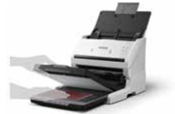
The flatbed scanner conversion kit enhances the device's already impressive flexibility

The conversion kit also allows for the scanning of passports 2 , books, glossy materials and bound media.