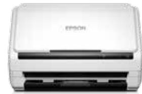
The compact and sleek design keeps the devices' footprint to a minimum

An automatic feed mode allows even the largest documents on a variety of media to be scanned easily as one file.