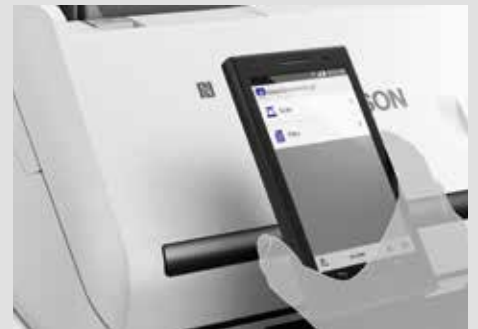
Scanning documents direct to a device of your choice offers flexibility for mobile workforces

The scanners can help your business gain control over critical information, improve the quality of your business decisions, and increase operational and process efficiency.