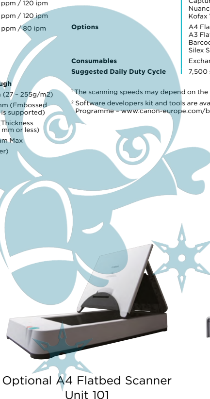
Optional A4 Flatbed Scanner Unit 101

The DR-M1060 comes with a host of optional accessories that enable users to be even more productive. The A4 and A3 optional Flatbed Scanner units allow users to scan bound books, journals and fragile media. These USB-connected dual-scanning flatbed units work seamlessly with the DR-M1060, so users can apply the same image-enhancement features to any scan. A 2D Barcode Module is also available that enables barcode recognition of QR codes, PDF417 and Data Matrix formats.