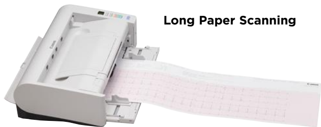
Long Paper Scanning