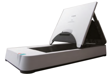
A4 Flatbed Scanner Unit 101